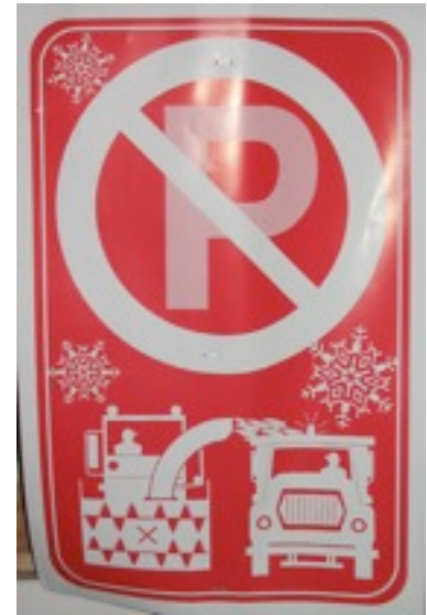
Areas of No Parking during snowfall:

Please, slow down when exiting the complex. Because of melting snow, ice may form on Bunker Hill Road just before the intersection with Grafton Street. Accidents have happened before.