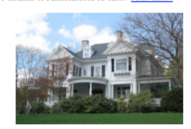
2005 - Fire Inspection Year