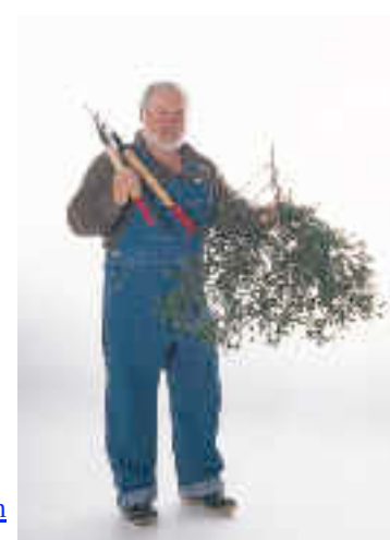
Woodsman's Home page . You can also access through our menu system at any time.

The Ole Woodsman always invites your comments and suggestions. <u>Just send them here and they will be passed along.</u>