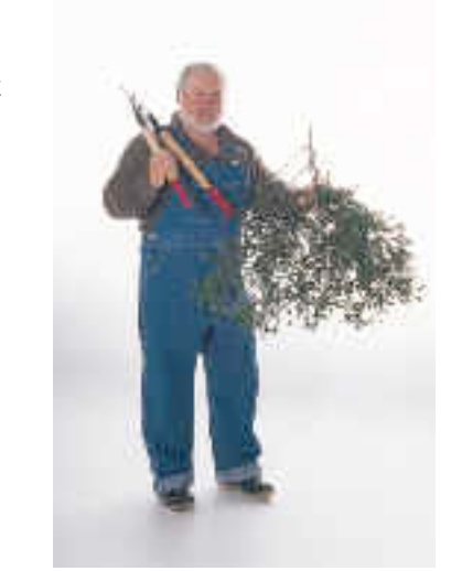
Woodsman's Home page . You can also access through our menu system at any time.

The Old Woodsman always invites your comments and suggestions. <u>Just send them here and they will be passed along.</u>